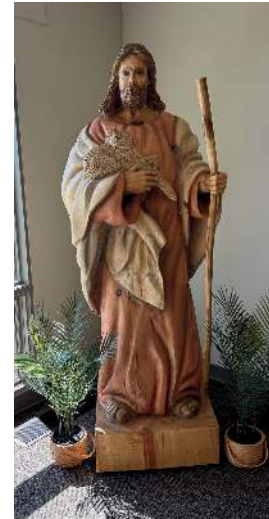
Located at St. Francis in Shepherds Hall